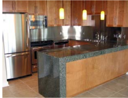
New Modern Kitchen with GE Profile Appliances