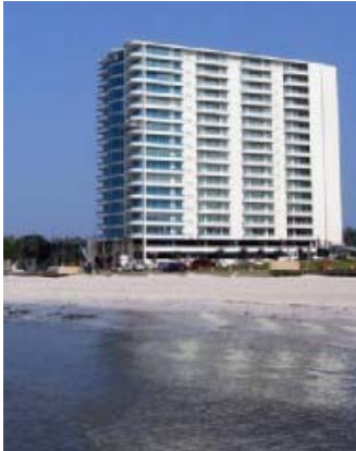
Experience our Luxurious Ocean Club Condo