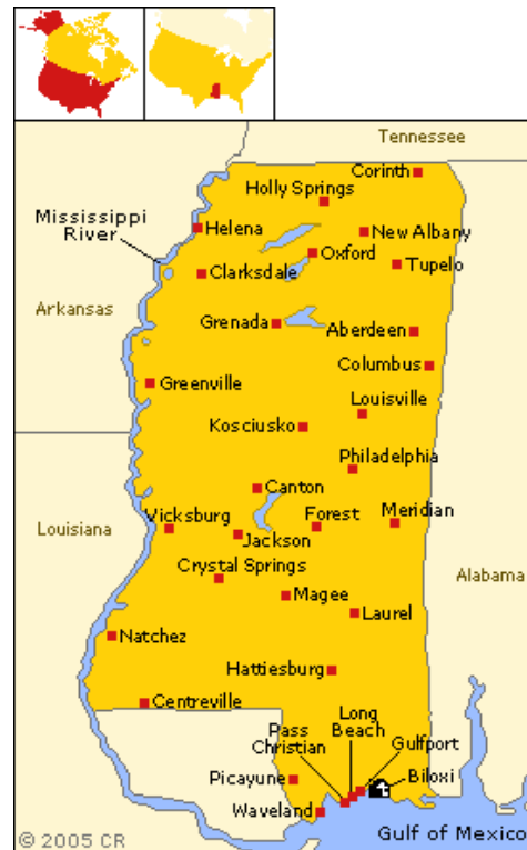
marks the location of the property

We are located IN Biloxi and in the Hub of the Action!! The Premier Biloxi Vacation Rental. Definitive Coastal Activities; Las Vegas style Gaming and Entertainment ** Historic and Cultural Attractions ** Picturesque Beaches ** World Class Fishing ** Boating ** Sailing ** Water Sports ** Championship Golf Courses ** Excellent Shopping & Dining ** average annual temperature of 68 degrees ** Beautiful Sunsets ** Close to New Orleans, Mobile and the Florida Panhandle ** Vacation on the Gulf Coast for a Richly Satisfying Experience, come on down and make some memories. Only 2.8 miles west of the Beau Rivage Casino. Just five minutes west of Casino Row, Imperial Palace and Boomtown Casino. 1 mile to the Gulf Coast Coliseum. 2 miles to the Edgewater Mall. 8 miles to Water Park. We are only an hour to New Orleans for the night life and national football and basketball games with the Saints and Hornets. There is something for everyone in the Biloxi area.