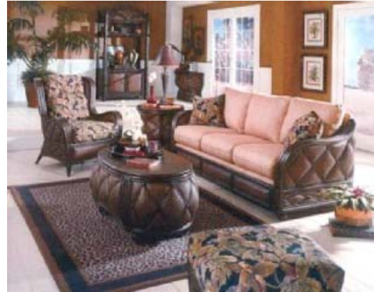
Comfortable Living Room. Color will vary slightly.