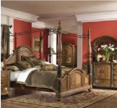
Master Bedroom with King size 4-Poster Bed